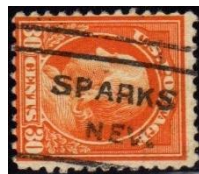
7.4642 DLR and another one